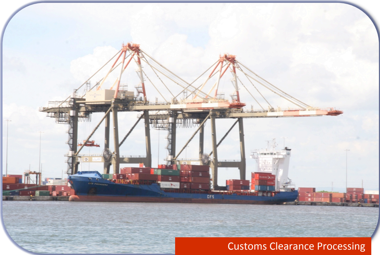
Customs Clearance Processing