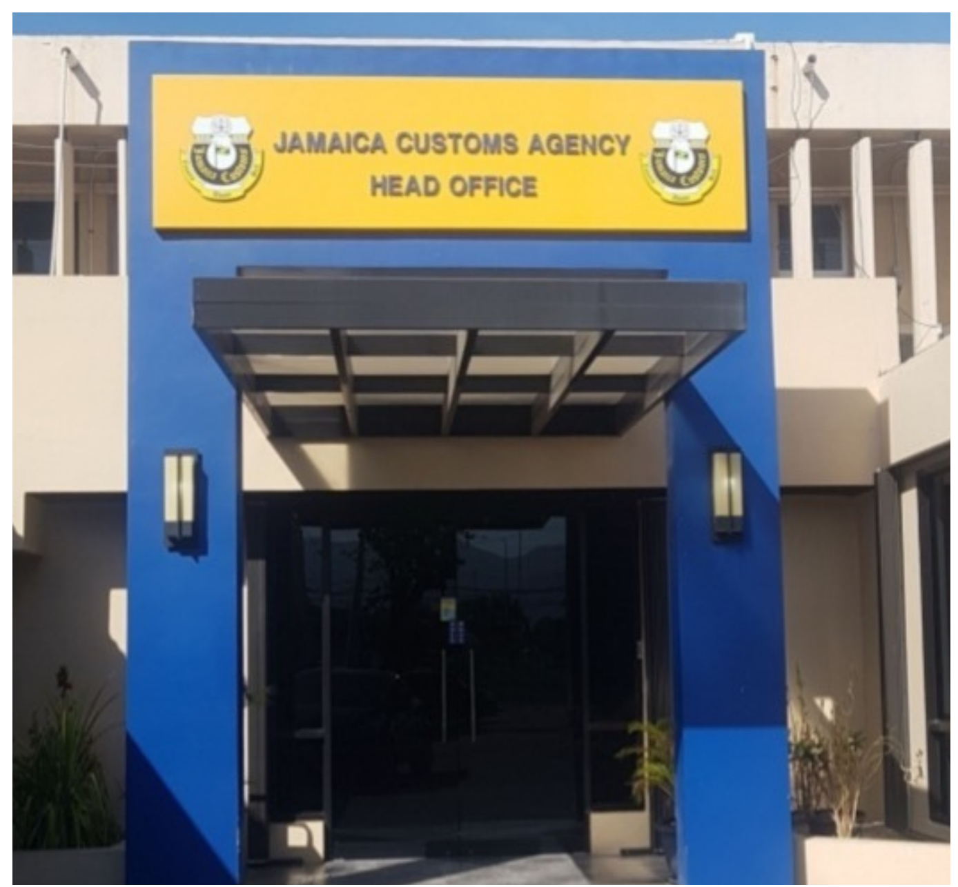
Jamaica Customs Agency Head Office located in Kingston, Jamaica

The International & Industry Liaison Branch (IILB) is committed to raising awareness on topics relating to the International Trade, as well as issues concerning the Caribbean Community which may affect our internal and external stakeholders. Our quarterly Newsletter seeks to highlight global trade topics and their importance to Customs Administration worldwide, specifically as it relates to the Jamaica Customs Agency.